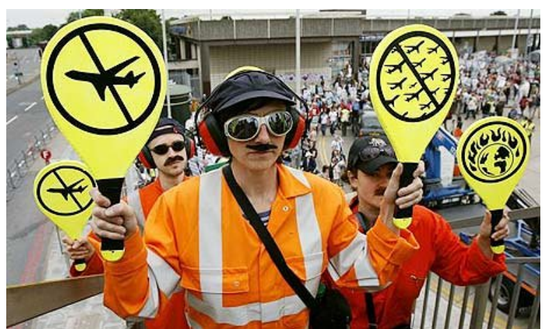
A previous flashmob at Heathrow Airport in London