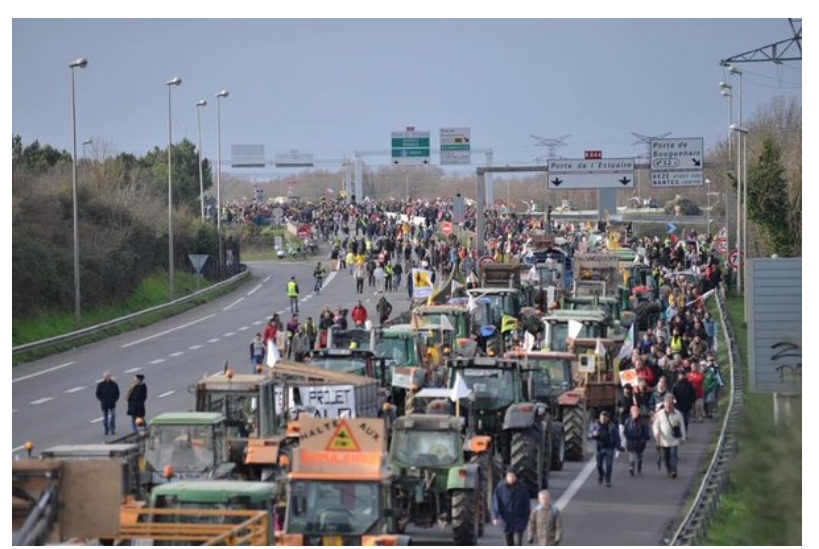
Previous blockade at Notre-Dames-des-Landes, France