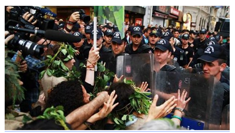
Previous forest defence demonstration in Turkey